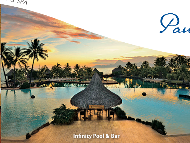
Infinity Pool & Bar