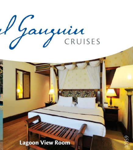
Lagoon View Room