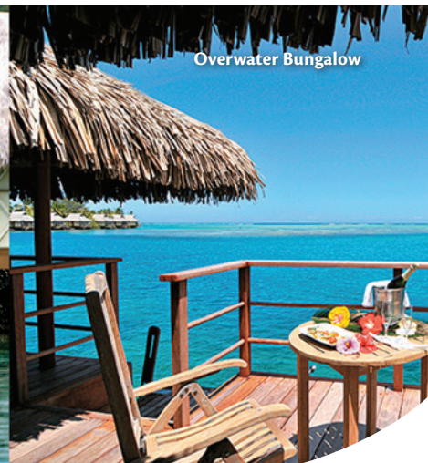
INTERCONTINENTAL MOOREA RESORT & SPA